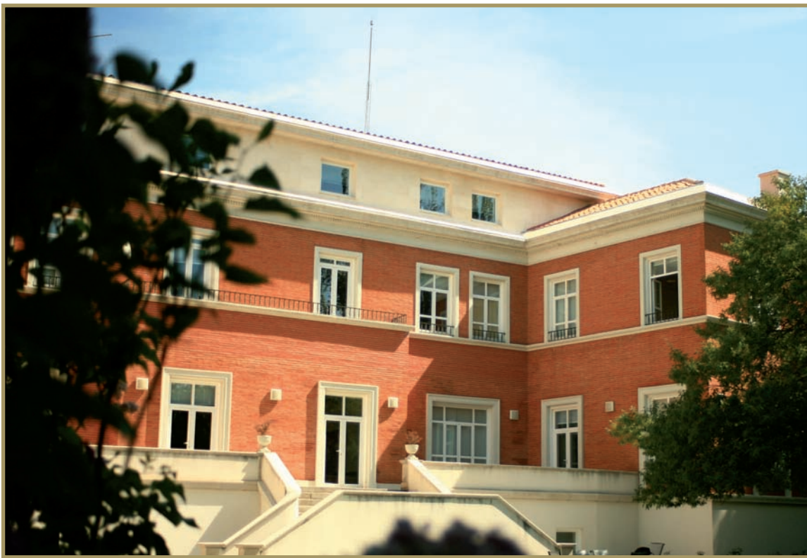
PIOB Secretariat in Madrid.