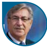
KARMENU VELLA Commissioner for Environment, Maritime Affairs and Fisheries, European Commission

He is a member of the French "Académie de Marine" and (reserve) Navy Captain