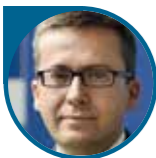
CARLOS MOEDAS Commissioner for Research, Science and Innovation, European Commission