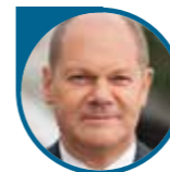
OLAF SCHOLZ First Mayor and President of the Senate of the Free and Hanseatic City of Hamburg

On 1. March 2015, he became the Director of the Environmental and Sustainable Territorial Development Depart-