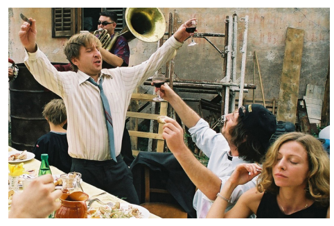
Odgrobadogroba / Gravehopping