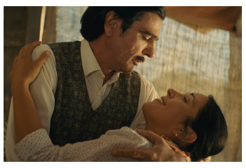
Sanghaj / Shanghai Gypsy