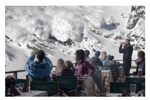
Turist / Force Majeure