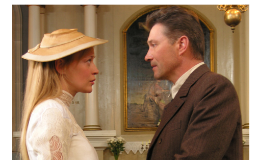
Rīgas sargi / Defenders of Riga

Pizzas (2015) CinemaXXI Special Jury Prize at Rome Film Festival