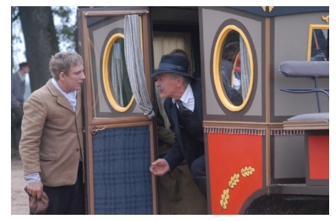
Rūdolfa mantojums / Rudolf's Gold