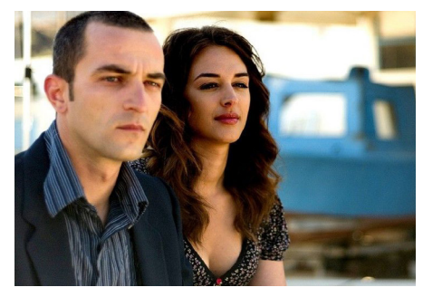
Μικρό Έγκλημα/ Small Crime