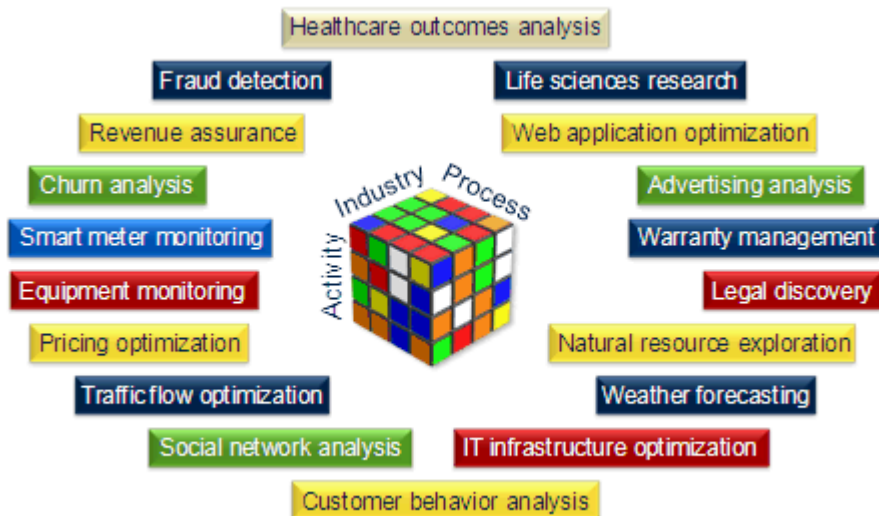
Big Data Technology and Services Sample Use Cases