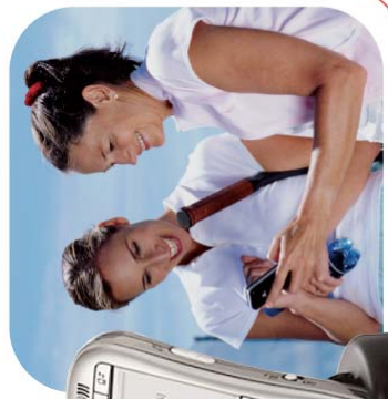
eg. Vodafone Simply handsets