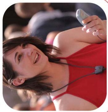
eg. Hearing Heads