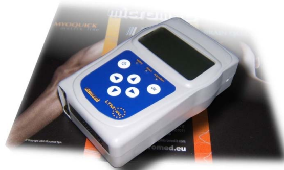
Fig. 1. The Brainatics. The EU-LTM prototype

state of the art device which can acquire and transmit EEG-ECG data to a computer by cable or by Bluetooth. The device, shown in Fig.1, is small and lightweight.