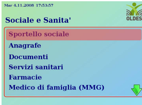
Picture 1. User Interface

Facing the challenges of an ageing society, there are also chances: technological and social economic innovation as well can enhance the quality of life for older and impaired people; moreover they can harness the economic problems of an increasing ageing population and create new business opportunities. In short ICT can make key contributions to an independent living of the elderly.