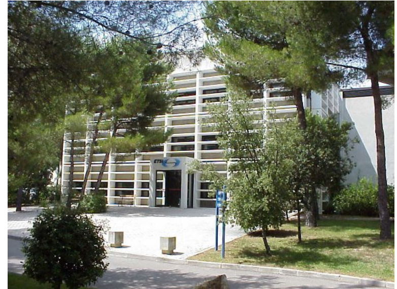
Located here at Sophia Antipolis, France