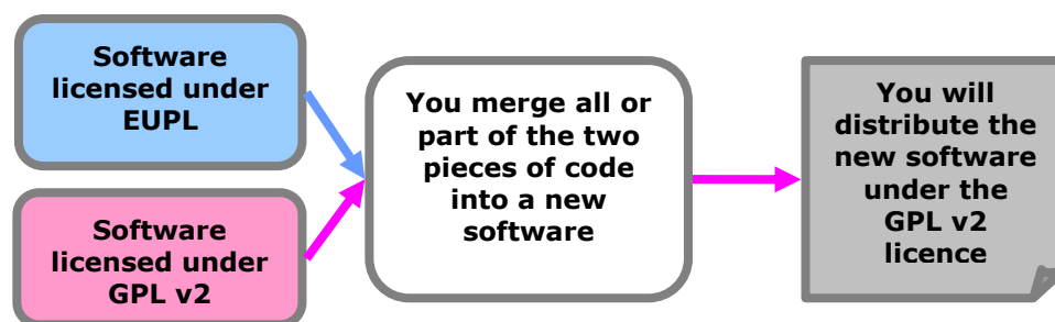
Figure 2: Compatibility clause

If you decide to re-distribute the derivative work, you will re-distribute this work under the provision of the GPLv2. This is an obligation resulting from the GPLv2, which is “copyleft”. The EUPL solves the “conflict of licences” by authorising you to comply with such an obligation.