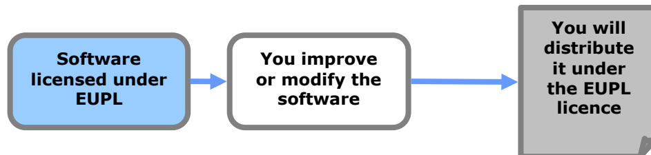
Figure 1: “Copyleft” effect

licence (without modifying the licence terms) to the whole derivative work.