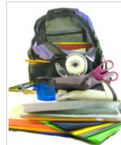
The Danish EPA found a variety of phthalates in school supplies.

Phthalates are a group of chemical compounds widely used as additives in a range of plastics and other materials that are found in many consumer products. They make plastics, such as PVC, soft and flexible. They are not chemically bound to plastics, so they can be released from consumer products into the environment and may result in human exposure. There is public concern about phthalates because of their widespread use, including in products for children, and their potential effects on human health.