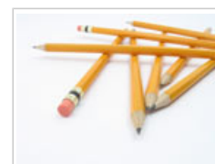
Phthalates in tested school supplies do not contribute significantly to total exposure of children.

The Scientific Committee on Health and Environmental Risks (SCHER) concludes that the phthalates present in the school supplies tested by the Danish Environment Protection Agency do not significantly contribute to the total amount of phthalates taken in by children.