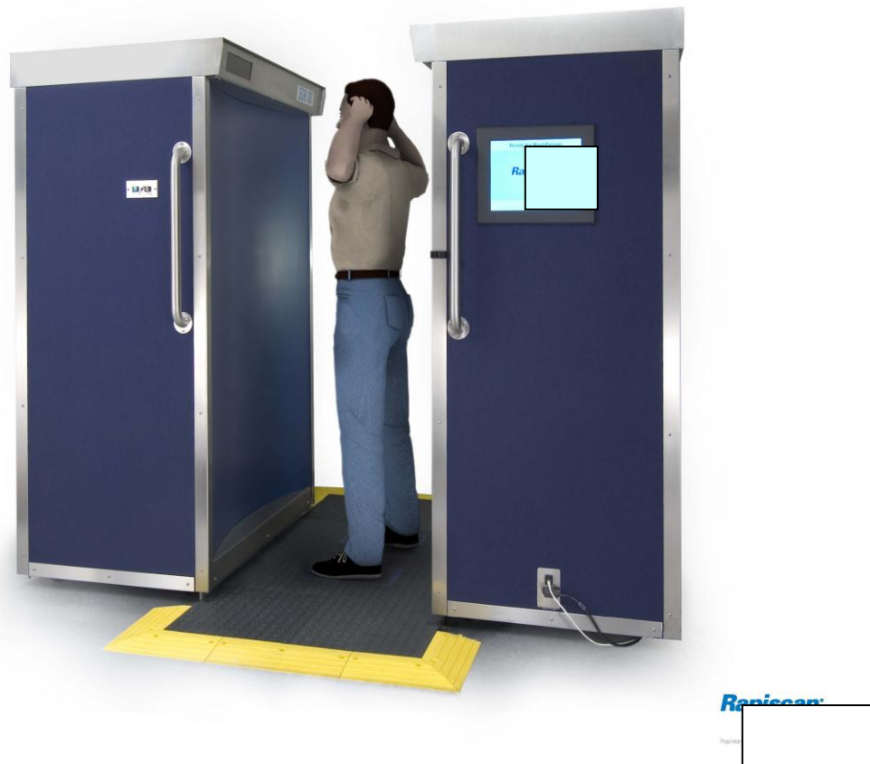
Figure 1: A modern backscatter unit showing a passenger being screened.

Backscatter X-ray systems use a narrow, pencil shaped beam that scans the subject at high speed in a horizontal and vertical direction. Large detectors are installed on the same side of the subject as the X-ray source. The person stands in front of the enclosure and is scanned by the X-ray beam, which has a typical cross-sectional area of approx. 25 mm 2 . Usually the person is scanned twice, once from the front and then from the back. Sometimes lateral scans are also performed. Typical systems use an X-ray set operating at fixed peak voltage (kVp) and current (mA) settings. These are typically 50 kV and 5 mA. The total filtration to reduce the low energy component in the X-ray beam, which is ineffective in the detection mechanism, is in the range of 1 mm to 7 mm aluminium equivalent. The duration of a single scan can be up to 8 seconds.