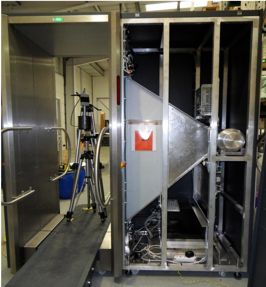
Figure 2: A modern transmission unit with the side maintenance panel removed.

X-ray systems that use both backscatter radiation and transmitted radiation in a single scan procedure are also commercially available.