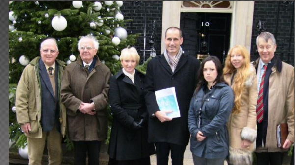
Photograph taken at Number 10 Downing Street, London

The RRT gained charitable status in 2003 and is supported by MPs and MEPs from the UK political parties. We are also indebted to Independent Scientific, Public Health and Technical Advisors.