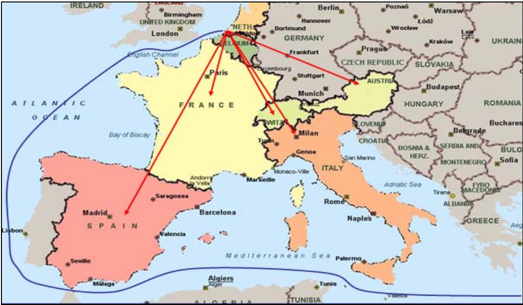
Map 1 Footprint of the current scenario

This situation reflects a better level of service provided by ports in the Northern range and probably a lack of attractiveness in some Mediterranean ports. Ports in the Northern range are more efficient and reliable compared with ports in the Mediterranean; moreover they have more efficient and appropriate surface transport connections, are less congested and can process goods very quickly.; finally, the greater frequency of shipping services to Northern Europe, caused by its larger (local) base load traffic volumes, has allowed shipping lines to use larger ships, reduce costs; this has also resulted in more shipping lines entering the market, thus creating more competition.