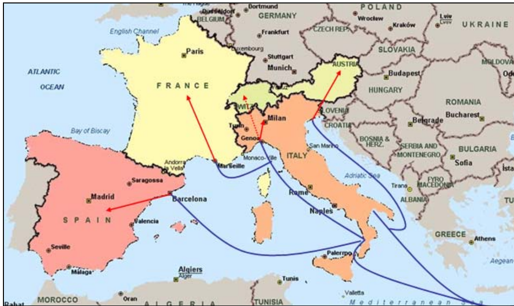
Map 2 Footprint of the “Alternative scenario”

Map 2 shows the containerised traffic departing from the Far East, and arrives to Switzerland, Italy, Austria, Spain and France through Italian ports. In the following table are reported the “origin / destination” distances (expressed both in km for road and rail and in nautical miles for maritime transport) for both of the scenarios: