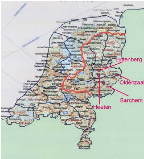
Figure 1: Location of BTV-6 cases in the Netherlands

Preventive measures were established effective immediately, to prevent further spread of this possible new virus type. Around the infected holdings a 50 km control zone was established and the whole country has been included in a restriction zone.