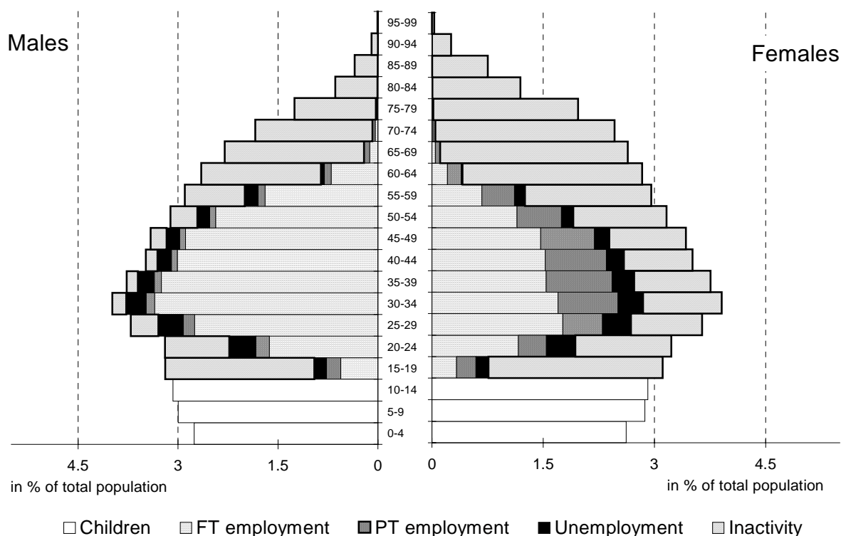
Figure 2: Activity by sex and age group, EU-15, 1998