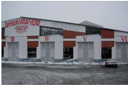
Bakhmetevsky Bus Garage, 1927. Architect Konstantin Melnikov, engineer Vladimir Shukhov