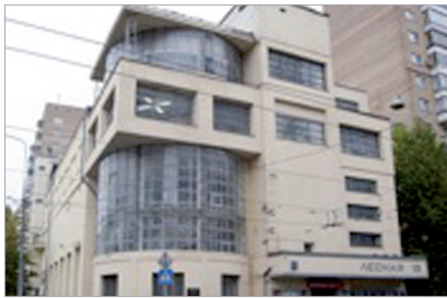
Zuyev Workers' Club, 1928. Architect Ilya Golosov