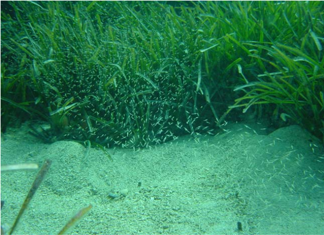
Posidonia oceanica meadow edge, with biogenic sands and mysida crustaceans.

P. oceanica is an endemic species to the Mediterranean Sea that forms dense and extensive green meadows whose leaves can attain 1 meter in height. These underwater meadows provide important ecological functions and services and harbour a highly diverse community, with some species of economic interest.