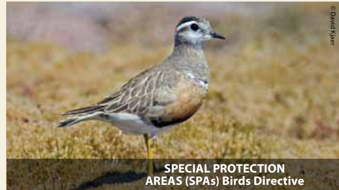
SPECIAL PROTECTION AREAS (SPAs) Birds Directive