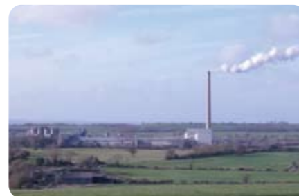
Lafarge's Westbury Plant in Wiltshire, UK