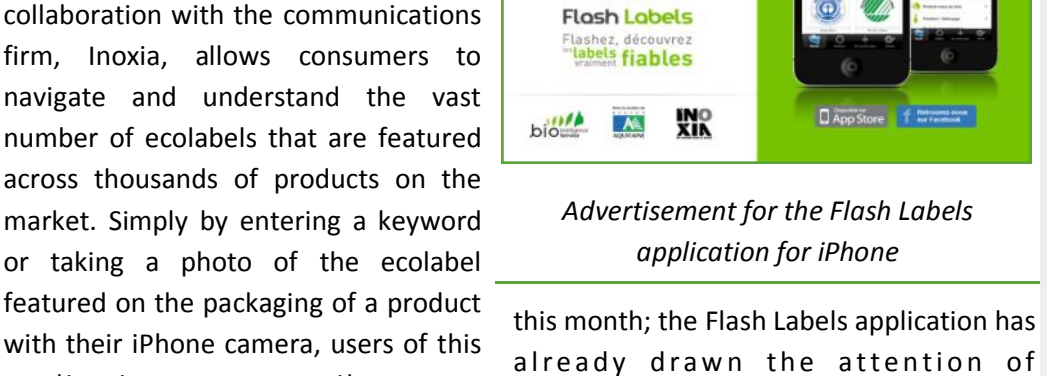
The Flash Labels application can downloaded, at no cost, from the iPhone