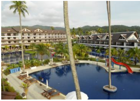
The Kalama Beach hotel, Thailand

The Sunwing resort Kalama Beach in Phuket Island Thailand, is the first hotel to receive the EU Ecolabel award in Asia.