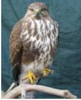
Taxidermy specimens (but note advice on “renovation” at paragraph 5.8)