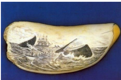
Scrimshaw whale's tooth (the surface of the specimen engraved with pictures and/or lettering, with the engraving highlighted using a pigment)