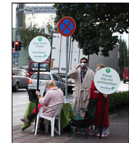
One of the teams showing the benefits of telework