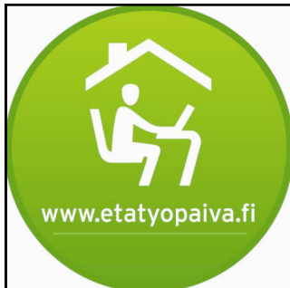
The National Teleworking Day logo

This year's 'Communication Initiative of the Year Award', launched in 2006 by the Green Spider Network (GSN), goes to an innovative Finnish campaign on telework. All the GSN members were invited to present their best examples of environmental communication campaigns. The prize was awarded at the Annual Meeting of the Green Spiders in Denmark, which took place on November 16 th - 18 th .