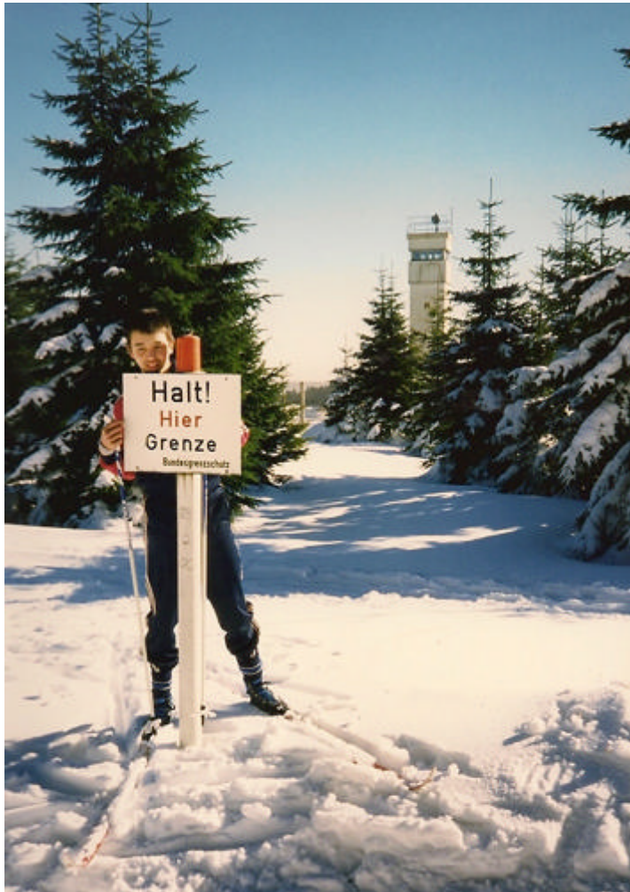
The author in the Harz mountains, 1988