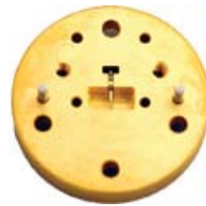
Monolithic InP-HBV chip mounted in a waveguide block

TeraComp undertakes the development of a low noise 557 GHz subharmonic Schottky diode mixer, a 275 GHz Heterostructure Barrier Varactor frequency tripler, a 92 GHz mHEMP power amplifier, and a 15 to 92 GHz 6x multiplier. Whilst contributing to European non-dependence, the development of these critical technologies is also set to increase the current state-of-the-art in this domain, making the technologies smaller and more energy efficient, and therefore more suited for satellite use.