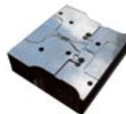
Terahertz single side band mixer block