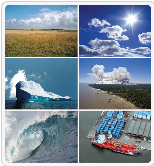
GMES/Kopernikus geo-information services are grouped into six interacting themes: land, atmosphere, climate change, emergency, ocean and security.

Yet information is much more valuable when it is effectively shared.