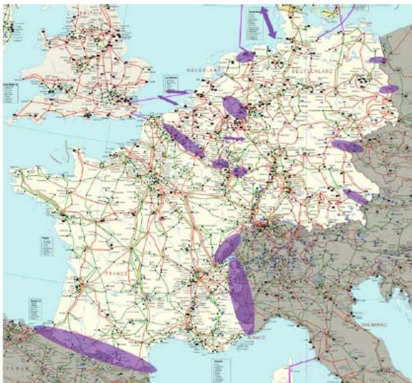
Figure 2b) Areas of congestion in the Regional Forum – Central East 14 .