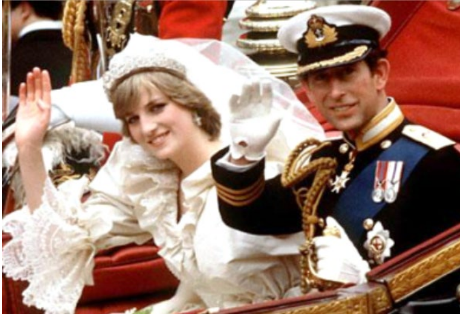
1981: Charles & Diana William (1982) Harry (1984)