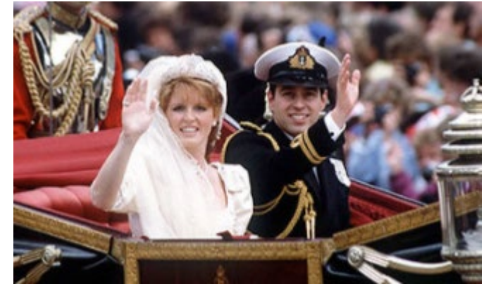
1986: Andrew & Sarah Beatrice (1988) Eugenie (1990)