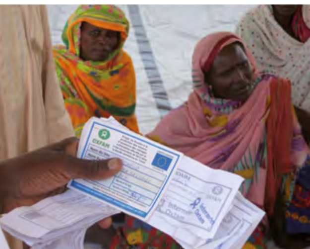
Cash based voucher in Sila region, Chad.