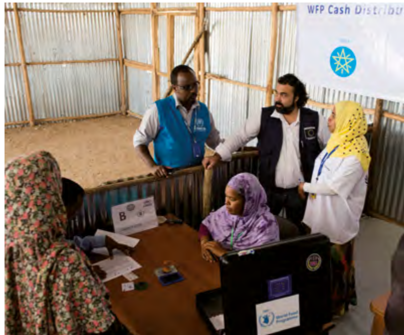
Cash distribution in a refugee camp, Ethiopia.

The Framework Partnership Agreement refers specifically to cash based interventions. The reference document is “Fact Sheet D.3 Cash for Returnees, Income Generation, Cash for Work, Revolving Funds, Unconditional Cash: Limits and Constraints». Vouchers are not covered in the fact sheet as they are considered as an alternative procedure for organising distributions.