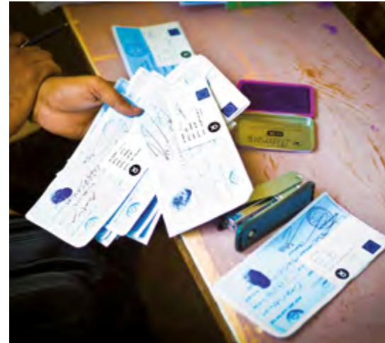
Cash distribution for a food assistance programme in Yemen.

An increasing number of humanitarian projects funded by DG ECHO include the distribution of cash and vouchers to beneficiaries. 2 An external evaluation of cash and voucher programmes was commissioned by DG ECHO in 2008, which concluded that they were successful in reaching their objectives, as well as offering greater choice to beneficiaries and helping to foster dignity in the receipt of assistance. Subsequent case studies and research pieces have further demonstrated the efficacy of cash and voucher programming in a variety of contexts and sectors. As such, between 2007 and 2011 there has been an increase from 2% to 23.1% of the budget share of food assistance projects to cash and vouchers and a quadrupling of projects with at least a partial element of cash programming. Both the European Commission Humanitarian Food Assistance Policy (2010) and EC Humanitarian Wash Policy (2012) support consideration of all transfer modalities.