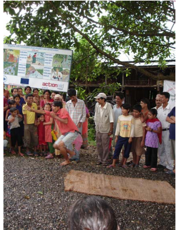
Street Dramas with DP messages

On the advocacy front, Action Aid, Nepal proposed to organize a joint-briefing of political parties ahead of the upcoming elections on integrating DP in Development policies of the government. All DIPECHO partners are planning to tie hands in joint collaboration for National Earthquake Day on 15 th January 2007 and collectively organize activities for the event under the DIPECHO banner. In addition, UNDP would be undertaking a mass media campaign on promoting disaster management messages in January. Moreover, UNDP has also planned a National Workshop on Disaster Management Strategy on 24 th January 2007 which would involve all stakeholders at the government and INGO levels. DIPECHO TA has been requested to TA ha scheduled a mission to Nepal from 23 rd – 25 th January to take part in this interactive and important platform and also use the opportunity to make the necessary arrangements for the upcoming NCM in Kathmandu.