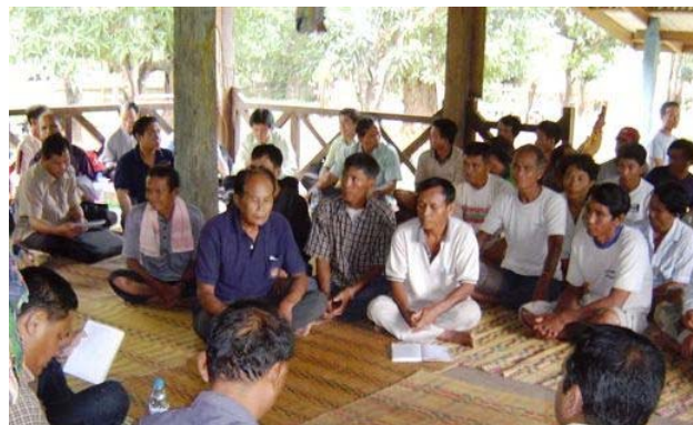
Flood preparedness training for provincial and district level officials under the MRC/ADPC programme

Through its Disaster Preparedness Programme DIPECHO, the European Commission Humanitarian Aid department (ECHO) aims at building the resilience of communities that face recurrent natural