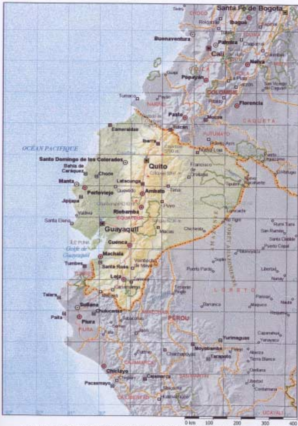
Evaluation of DIPECHO Operations in ECUADOR (Quito, Guayaquil)