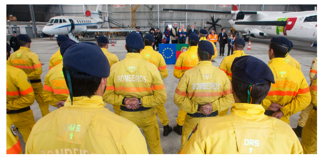
Visit of Christos Stylianides, to Portugal, 13 February 2017

In 2018, countries from the EU requested assistance nearly 10 times mainly for forest fires, medical support and marine pollution. 2018 has been a tragic year with almost 100 people losing their lives and wildfires burning in some European regions – that had never been affected before. The economic costs are huge: close to €10 billion in damages in Europe were recorded in 2016. Much of these costs could have been avoided if damage was prevented and societies better prepared.