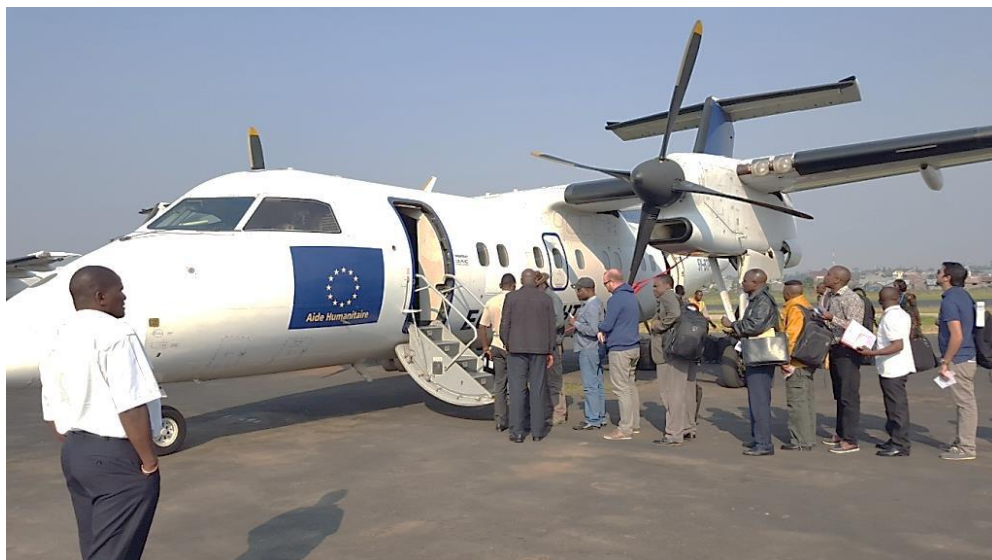
Humanitarian staff boarding an ECHO Flight to Kinshasa, DR Congo.

* All the latest ECHO Factsheets: bit.ly/echo-fs