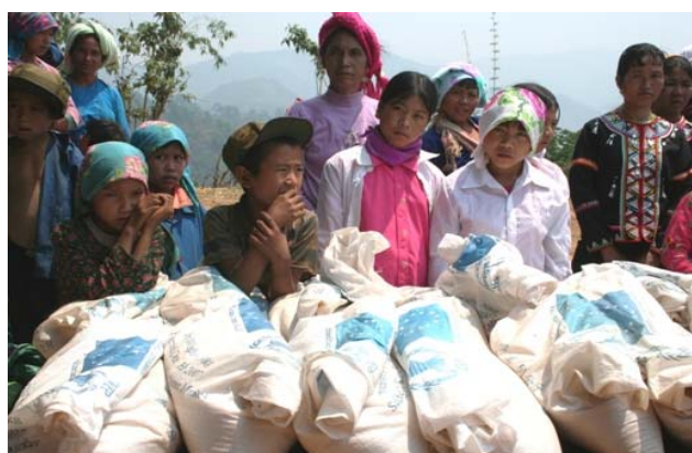
ECHO provides relief items to ease the suffering of people living in the country's frontier areas.