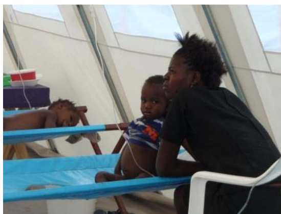
Little patient at CTC in Ouanaminthe

Given the starting rainy season and the potential strong hurricane season, compounded with the overall weaknesses of sanitary infrastructure (latrines, waste management), it is feared that any new outbreaks could affect massively the population. For the past weeks, cholera figures seem to be again on the rise due to the rainy season. MSF confirms that most of their cholera treatment centres (CTCs) have reached their maximum capacity in the Western department. The European Centre for Disease Control is undertaking a new mission to Haiti and Dominican Republic from 8 to 17 June in order to assess the situation.