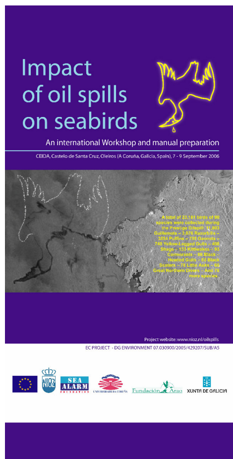
Figure 1. Conference logo and entry poster for the Santa Cruz International workshop, 7-9 September 2006 (design Antonio Sandoval Rey, A Coruña)

The first part of the project comprised a desk study, to provide clear-cut proposals at the workshop with state of the art techniques based on previous recent examples. In concreto , there was listed being compiled with European Seas that had been studied in terms of sensitivity to oil pollution and which areas were data deficient. That list had circulated in Europe to be commented on and was upgraded where possible and the list was made available at the workshop for further discussion and presentation. Similarly, species specific OVI's were analysed, listed, checked for completeness, circulated and presented at the international workshop as working documents.