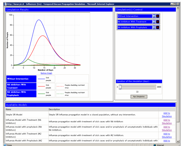
The DESMOS on-line simulation tool