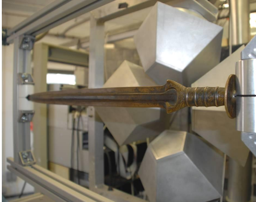
Figure 1. The Buggenum sword, dating from 1300-1100 BC, undergoing measurements at the Joint Research Centre (JRC) in Geel, Belgium. A beam of neutrons was directed onto the sword, and a technique called 'neutron-resonance capture analysis' was used to determine the composition and structure of the Bronze Age artefact.