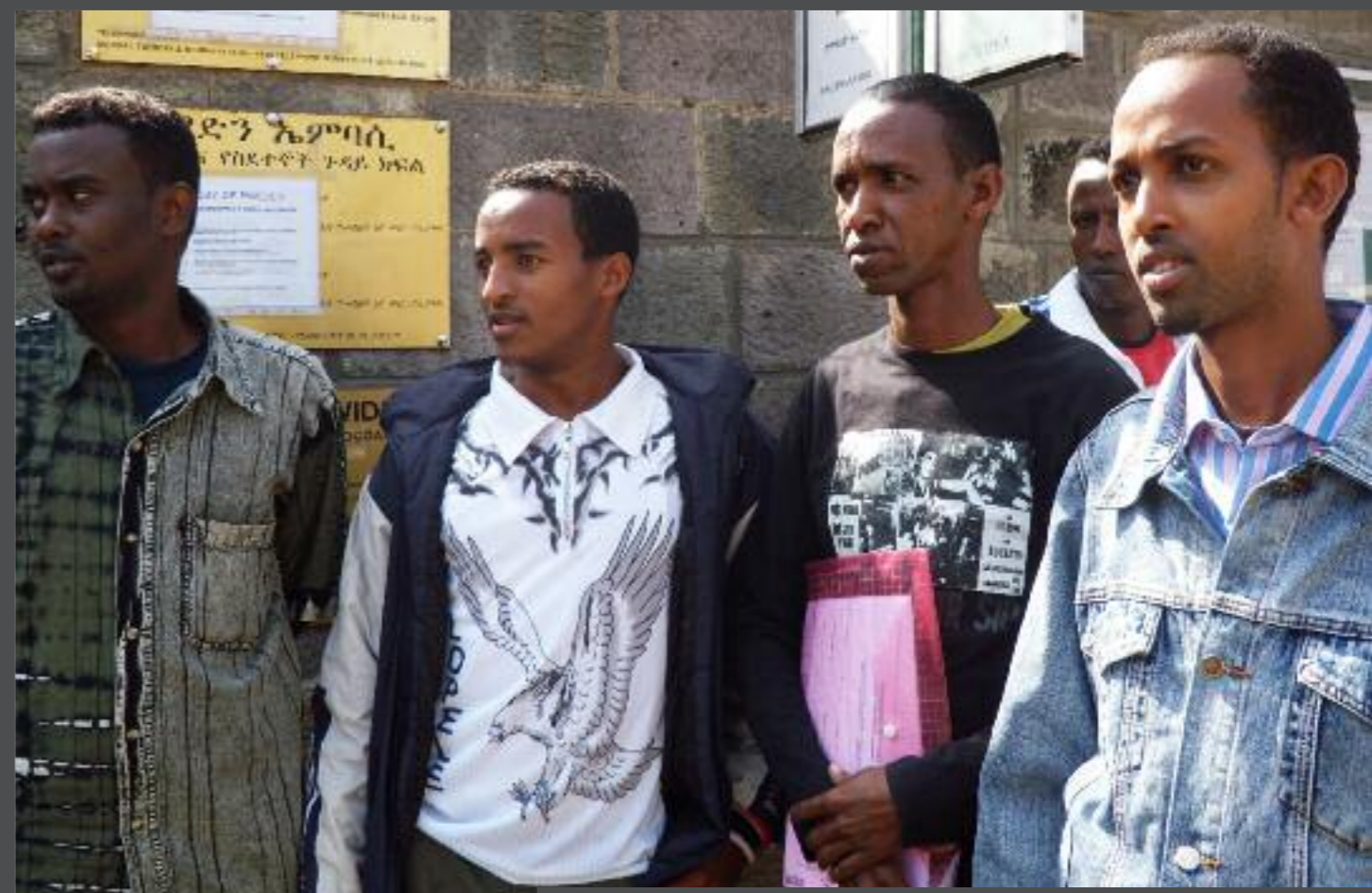
Each year, 6500 Somalis request a residence permit at the Swedish embassy in Addis

As a teenager, I lived in Kenya for four years and have always wanted to come back to Africa. I returned four years ago, when I set up the Swedish Embassy in Sudan. Then, as a Special Envoy Ambassador, I worked for two years on the Somali peace process. It is interesting for me