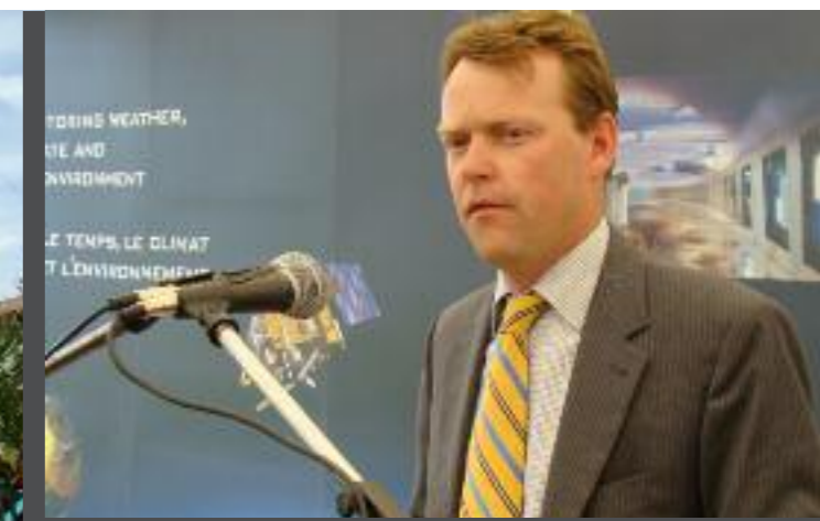
Mr Christophe KAMP, European Union delegation to the African Union

The project is the first concrete action in the field of environment within the framework of the Africa-European Union strategic partnership on climate change.