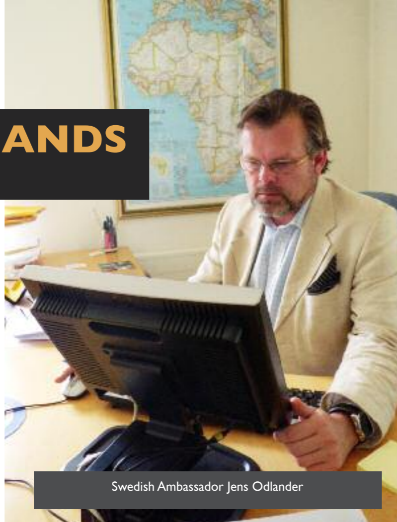
Swedish Ambassador Jens Odlander

As for the global challenges, I see two main priorities. First the preparation of the Copenhagen summit on climate change in December 2009. I foresee that we will try to negotiate a common position between the European Union and Africa. We will negotiate with Asia, the USA and China to prevent warming and climate change as much as possible. Second, we will have to coordinate a continued response to the