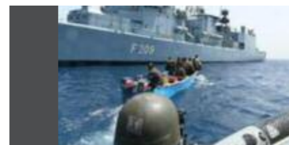
EU NAVFOR-ATALANTA Mission in action

Since 8 December 2008 the European Union has been conducting a military operation, named EU NAVFOR Somalia-Operation ATALANTA to help deter, prevent and repress acts of piracy and armed robbery off the coast of Somalis. This operation – the European Union's first ever naval operation - is being conducted in the framework of the European Security and Defense Policy (ESDP).