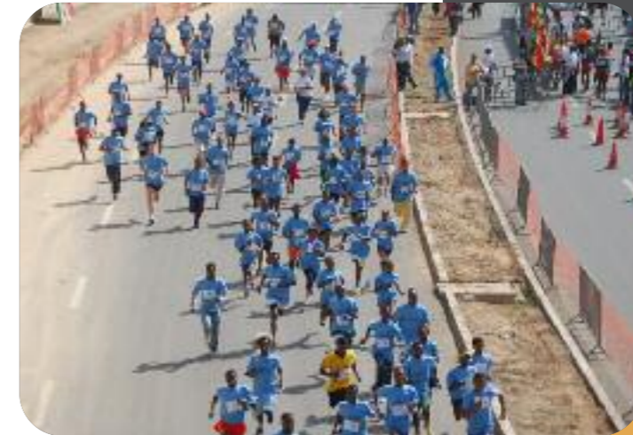
Start of the the run

Lord Kinnock is a former Labour party leader (1983-1992), former European Commissioner for Transport 1995-1999 and 1999-2004) and former Vice-President of the Commission. Lord Kinnock has substantial experience gained through reforming the Labour Party when he was party leader and leader of the opposition and later as Vice President of the European Union when he implemented a significant EU reform Agenda. He has been President of Cardiff University since 1998 and Chair of the British Council, the United Kingdom’s international organisation for cultural and educational relations, since December 2004.