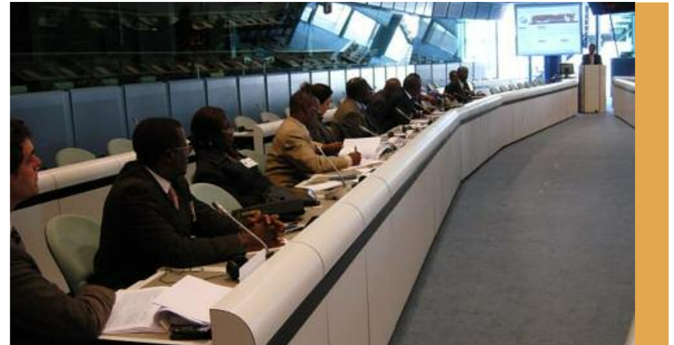
Pan african delegation in Brussels

Two pan-African delegations have visited Europe from 1 to 8 June, to attend a seminar on election observation and to attend the election of members of the European Parliament (EP).