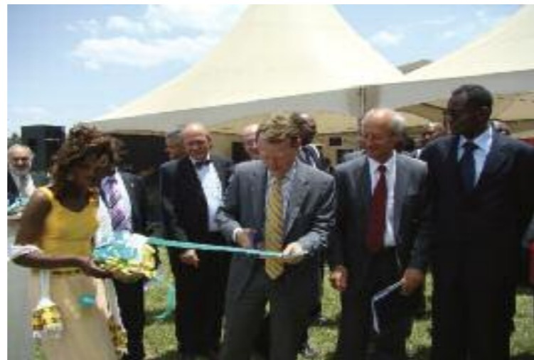
Inauguration