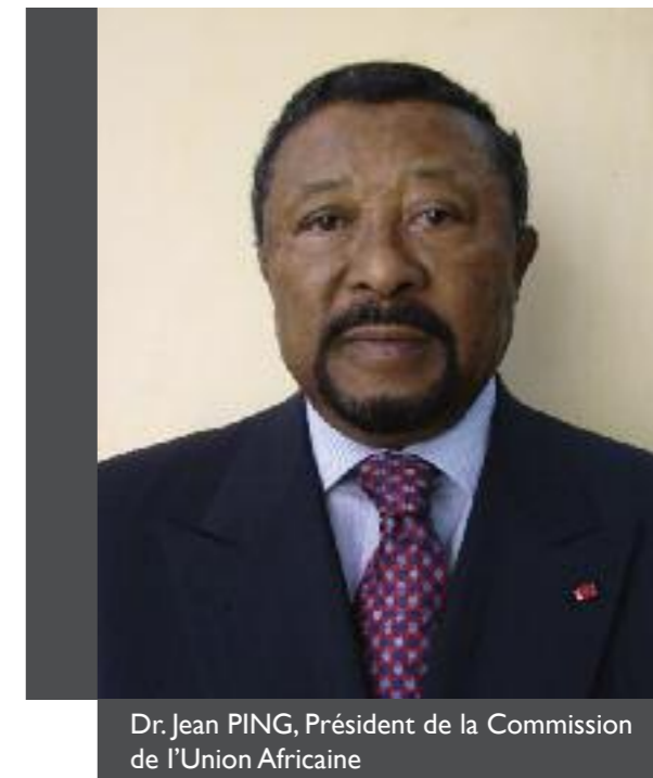
Dr. Jean PING, Président de la Commission de l'Union Africaine

manifestants. C'est une situation qui est potentiellement explosive. Selon la FAO, le nombre de personnes souffrant de la faim dans le monde atteint le chiffre record de 1,02 milliard de personnes. Cela représente un sixième de l'humanité et 265 millions de personnes en Afrique. Donc, lors de ce 13ème Sommet de l'UA, l'enjeu sera de renouveler notre engagement à bâtir une Afrique à l'abri de la peur et à l'abri du besoin en s'attaquant aux causes profondes des facteurs de crises sur le continent.