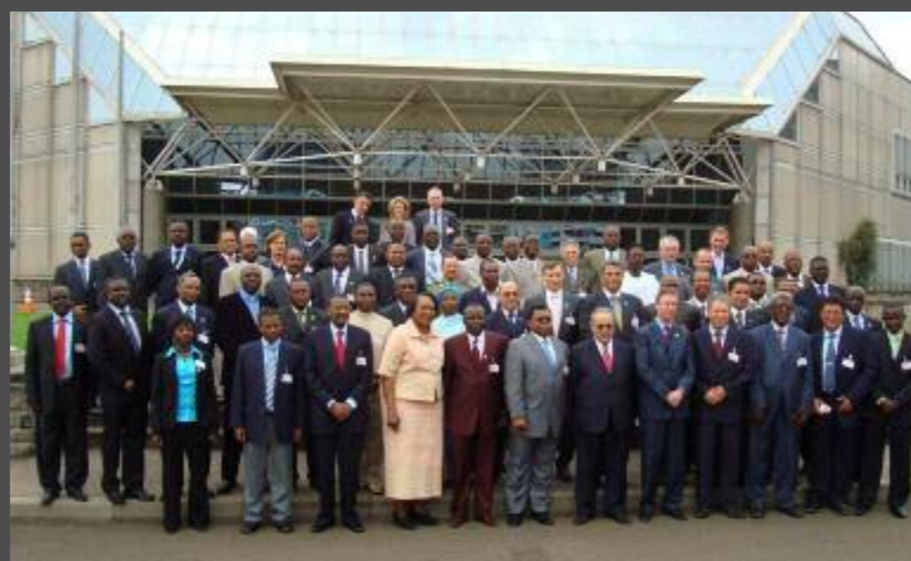
La Commission de l'Union Africaine et l'Union Européenne ont organisé le vendredi 21 novembre 2008 au siège de l'UA à Addis Abeba la Conférence d'initialisation du cycle AMANI AFRICA.

AMANI AFRICA s'inscrit parfaitement dans le cadre de la seconde action prioritaire du partenariat UE-Afrique en matière de paix et de sécurité, qui vise à rendre pleinement opérationnelle l'architecture africaine de paix et de sécurité (AAPS), dessinée à Maputo en 2002. L'outil d'intervention de cette architecture est la Force Africaine en Attente (FAA), qui regroupe des capacités militaires et civiles de gestion de crise et doit atteindre ses pleines capacités en 2010.