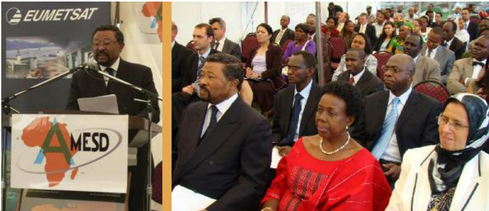
Jean PING, President of the Commission of the African Union