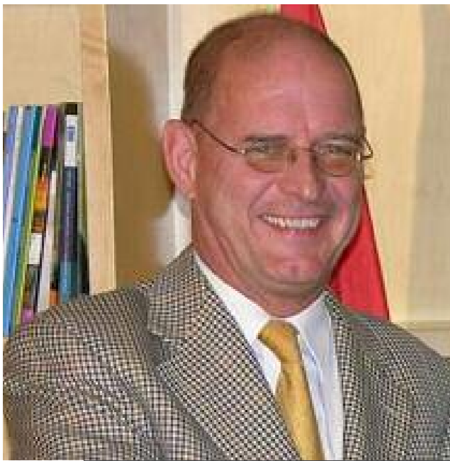
Dutch Ambassador Alphons Hennekens

effort to curb piracy in the waters around Somalia. Since my arrival in Ethiopia, I have visited Djibouti more than 10 times, not only for bilateral discussions. A number of visits were triggered by the presence of Dutch warships in Djibouti which were/are deployed in the region to secure maritime lanes from the subcontinent to the strait of Bab el Mandeb. Securing these lanes is of utmost importance to the economies of Europe and other countries. The strategic position of Africa in this context is obvious.