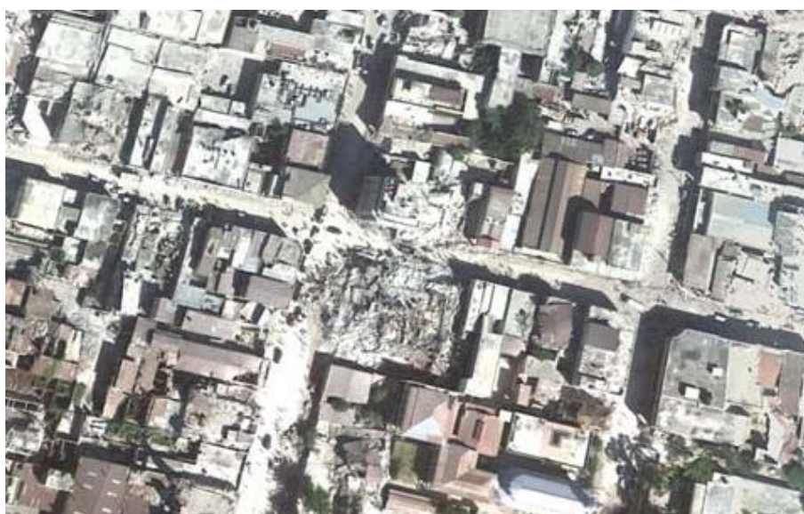
Severely Damaged Area in the Centre of Port Au Prince