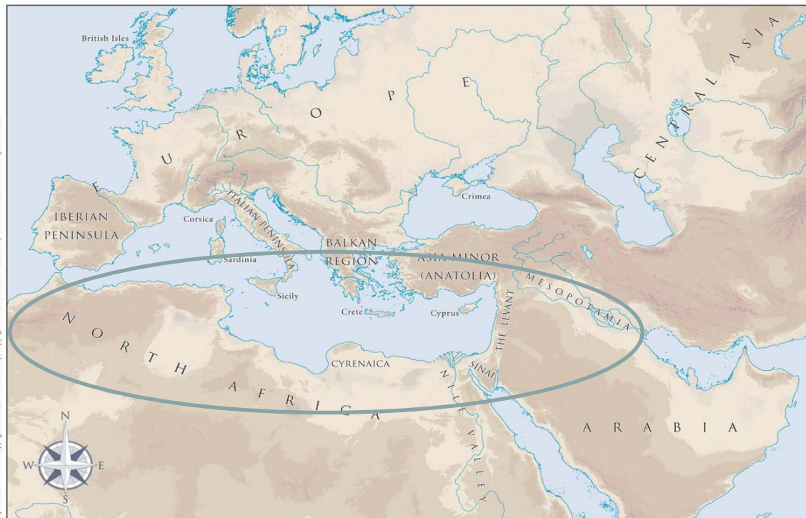
EUROPE, NORTH AFRICA AND WEST ASIA: REGIONS

This map may be reproduced and redistributed freely for non-profit, personal or educational use only. For all other uses, you must obtain prior written permission from the copyright holder(s). The authorship, copyright and redistribution notices may not be removed from the map or altered.