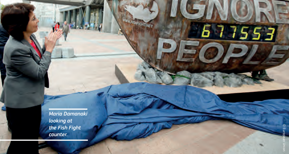
Maria Damanaki looking at the Fish Fight counter.

We, the policy makers, carry a dual responsibility here: we must make sure that populations are sustainably fed on one hand, and that the industry is competitive on the other. Aquaculture can solve a big part of both challenges.