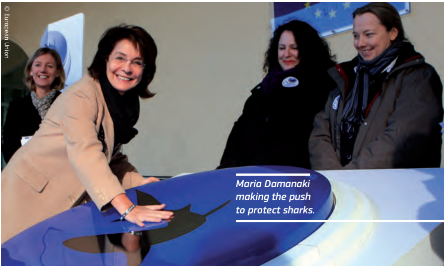
Maria Damanaki making the push to protect sharks.

Deep-sea fish , that are extremely vulnerable to fishing pressure, have been at the centre of our efforts to phase out destructive practices. Although the state of important stocks like black scabbard fish and roundnose grenadiers has been improving lately, we want to make sure that their fishing is fully sustainable and has minimum impact on the fragile deep-sea environment. In 2012 the EU became the first fishing party in the world to envisage the protection of the deep-sea environment at regulatory level by adopting a proposal to phase out bottom trawling and bottom-set gillnets in this particular fishery.