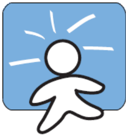
Plate forme européenne de la société civile pour l'éducation tout au long de la vie European Civil Society Platform on Lifelong Learning