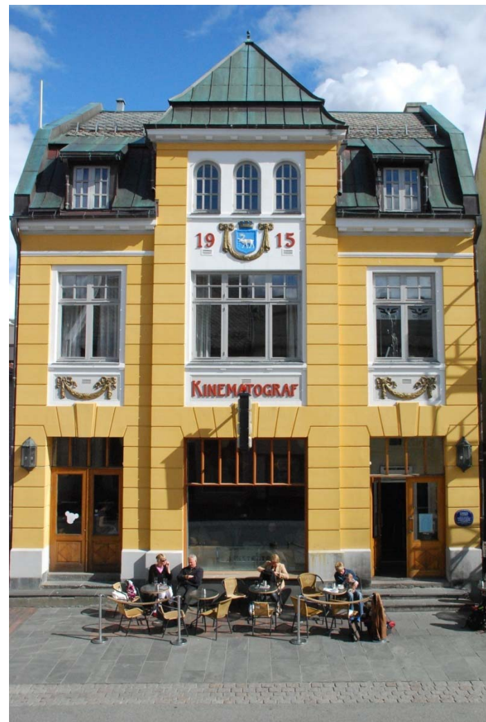
Verdensteatret Cinematheque in Tromsø, Norway's oldest operative cinema